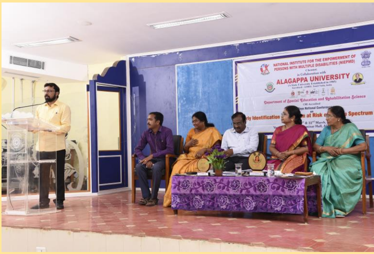
National Conference on Early Identification of children at Risk of Autism Spectrum Disorder, 21 st & 22 nd March 2019