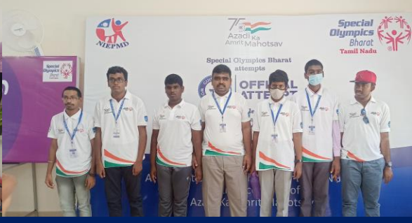
Athletes from DAIL Trainees has participated in Special Olympic Bharat Attempts event held on 07 th April 2022