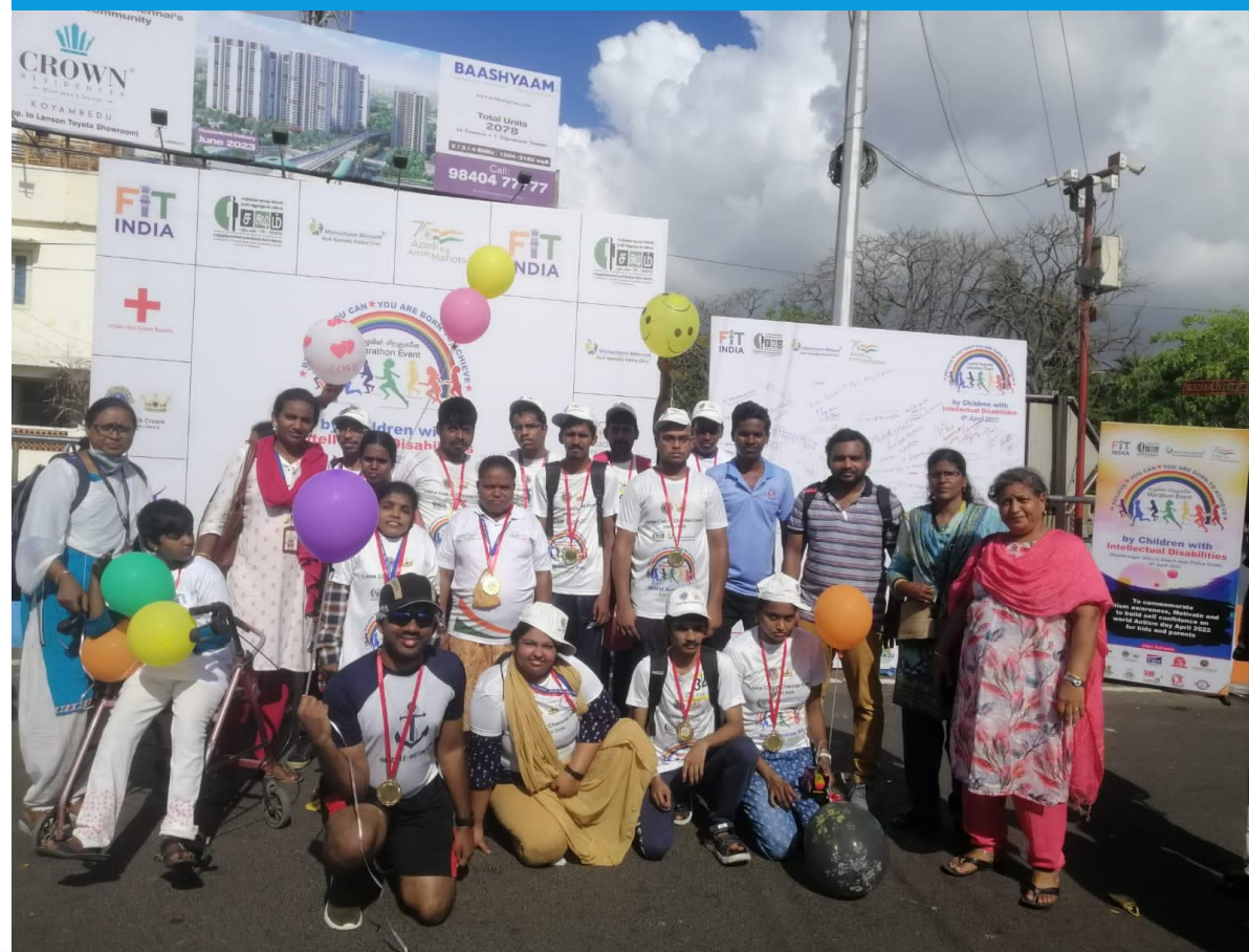
Participated in DAIL Trainees and their family members