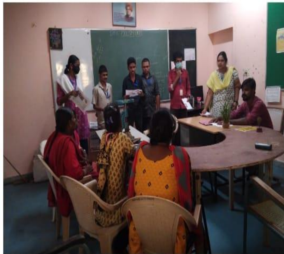
Domestic Data Entry Operator Trainees, DAIL creating awareness on Dehydration and Health benefits of Summer fruits in Summer season with Trainees of Hand Embroidery course on 28/04/2022.