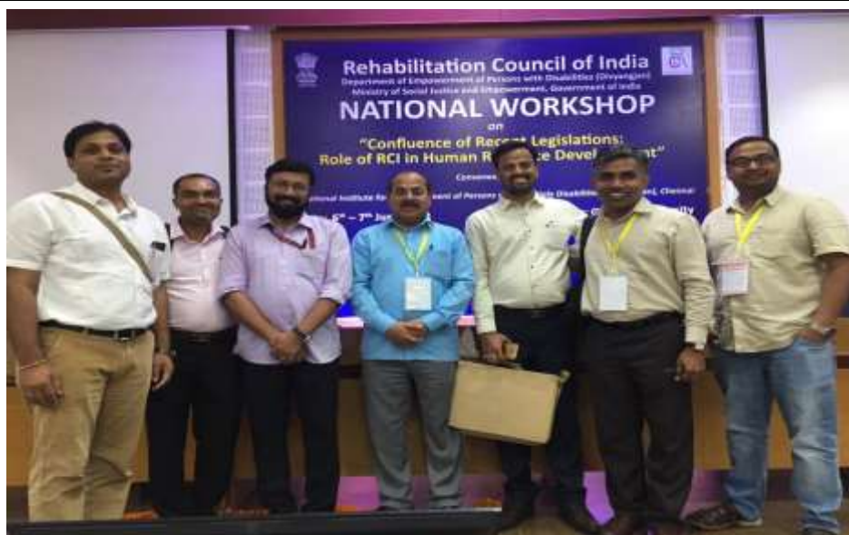
NATIONAL WORKSHOP on Conference of Recent Legislations: Role of RCI in HRD held at Guwahati on 6 th and 7 th June 2019