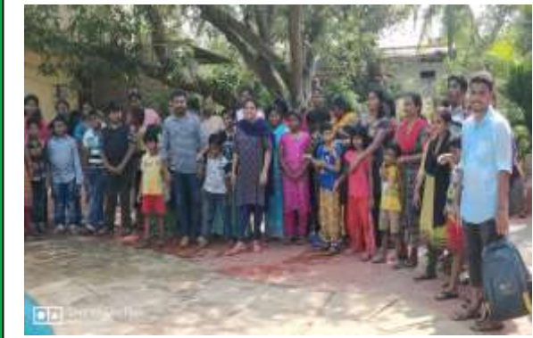
Water Sports activity for Children with Special Needs attending General Services on 24.5.19