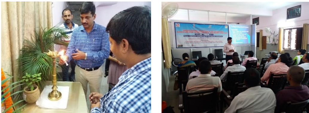
CRE Program on “Understanding Transition in the Life of Persons with Disabilities across Life Span, Infant, Children, Adolescent & Old Age” during 8 th to 12 th Oct 2018 at CRC Gorakhpur