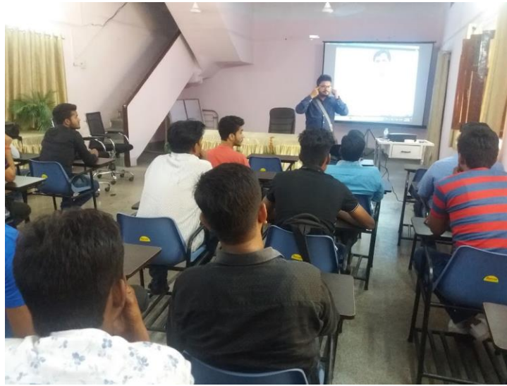
Indian Sign Language Training Prog. at CRC Gorakhpur in collaboration of “Deaf Welfare Society” Gorakhpur on 6 th , 7 th & 21 st Oct 2018: