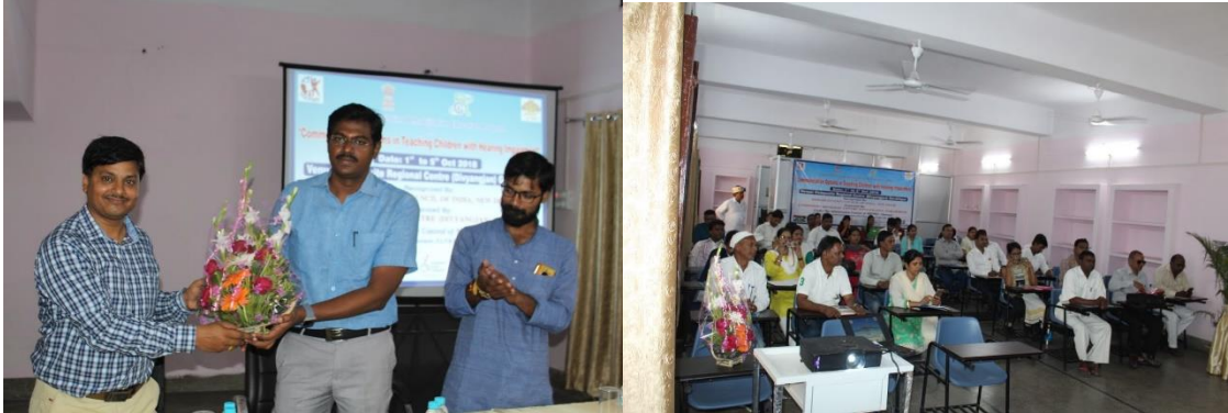
CRE Program on Communication Options in Teaching Children with Hearing Impairment” durint 1 st to 5 th Oct 2018 at CRC Gorakhpur