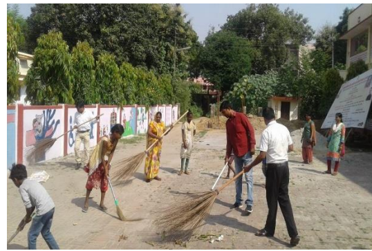
SWACCHATA PAKHWADA Clean drive activities at CRC Premises