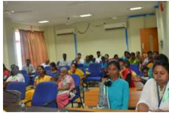
Parent Training Program