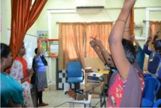
Awareness program for Staff and Faculties