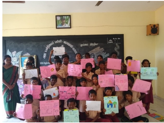
Orientation on Handwashing to PwDs, Parents of PwDs and HRD trainees